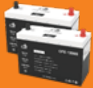
2 x 12V 100Ah CFE Lithium-Ion Battery